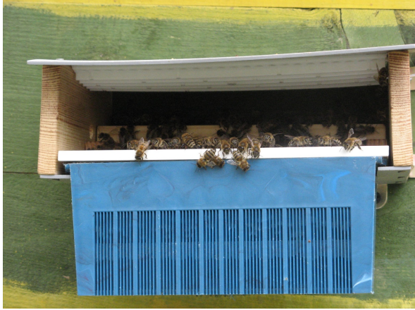
Fig. 1. HEA-1 hive entrance attachment

We developed a mathematical model to determine a power and a quantity of LEDs and to simulate parameters of the hive entrance attachment. Realization of the described model is the solution to a set of inequalities according to vector criterion (2)