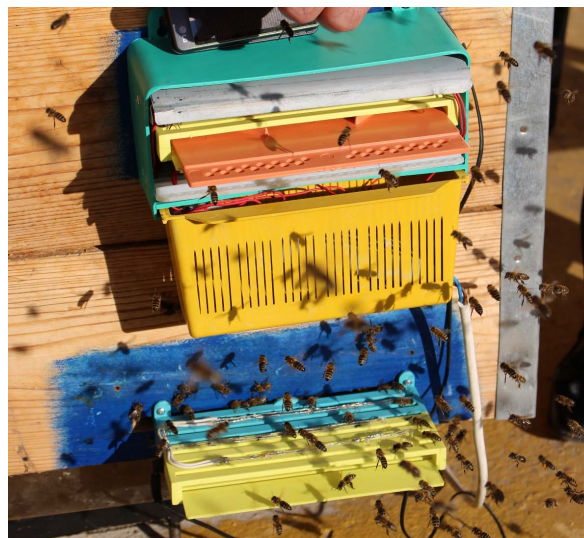
Fig. 4. Design of the hive entrance attachment with a solar collector

Table 4 gives results of the determination of effectiveness of the hive entrance attachment with an irradiated module of the UV spectrum, as a tool to fight against varroatosis.