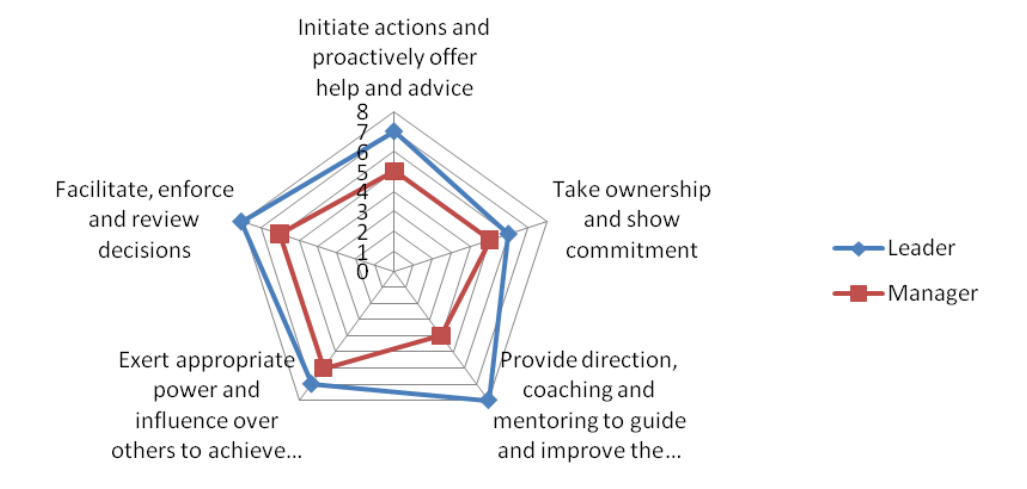
Fig. 3. Flexible Leader and Leader Behaviour Patterns

The analysis of the flexibilities of the Flexible Leaders and Leaders behaviours identifies significant gaps incompetence across individual key competency indicators. For example, in the Leadership competency element by key competency indicator, 5.1. Provides direction, coaching and mentoring for leadership and enhances the work of individuals and teams. There is a significant gap between the Flexible Leader and the Leader (fig. 3).