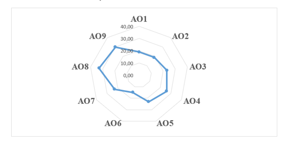
Fig. 2. Profile of the assessment of financial security of art-investment according to the selected parameters of the internal environment of the investment portfolio of art-objects of contemporary Ukrainian artists

objects of contemporary Ukrainian artists is presented in fig. 2.