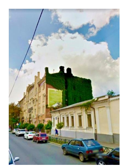
Fig. 2 – Building of NUPh, Kharkiv

Regional Department of Forestry and Hunting) and production resources, involving modern scientific developments and using design fantasies to improve the urban environment. After all, it is very important to take into account a comprehensive approach to create a comfortable visual environment in the city of Kharkiv.