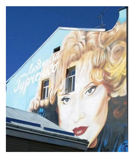
Fig. 3 – Portrait of Lyudmila Gurchenko [20]