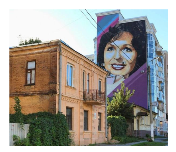
Fig. 4 – Portrait of actress Natalia Fateeva [21]