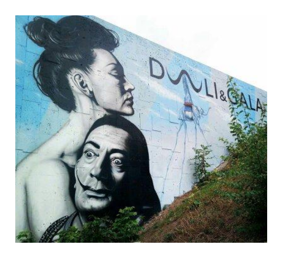
Fig. 5 – Graffiti Salvador Dali, Kharkiv