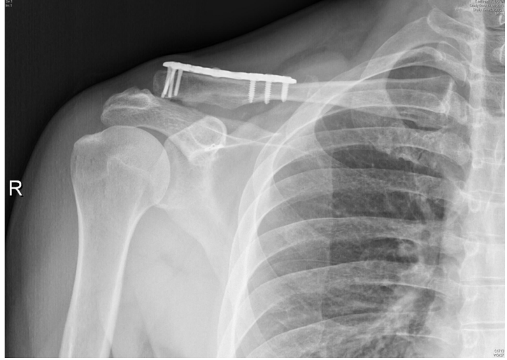
Fig. 3. 33 year's man's follow-up shoulder AP x-ray image showing that achieved union clavicle distal communicated fracture

tion. The AC joint was observed, and remained reduced and normal without any radiological degeneration findings in all cases. Implant loosening was not seen in the plate or ZipTight<sup>TM</sup> device. Hardware removal was performed for prominence in one case after the union was completed.