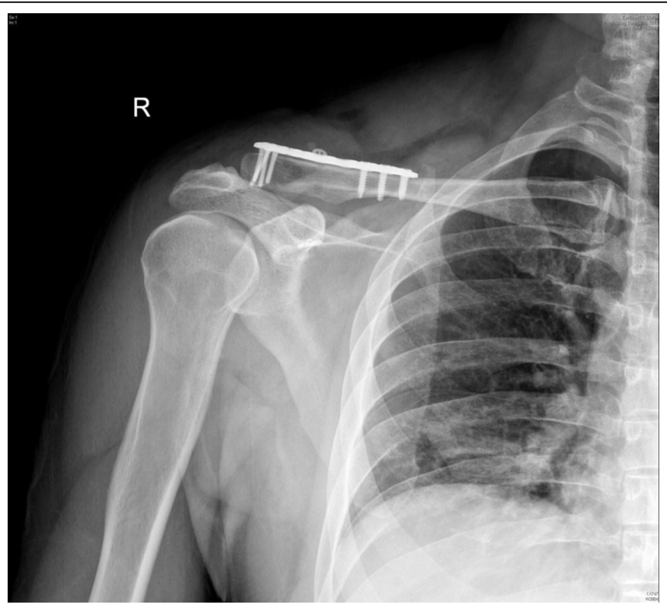
Fig. 2. 33 years man's postoperative shoulder AP x-ray image showing that clavicle distal communicated fracture that fixed anatomic plate augmented ZipTight