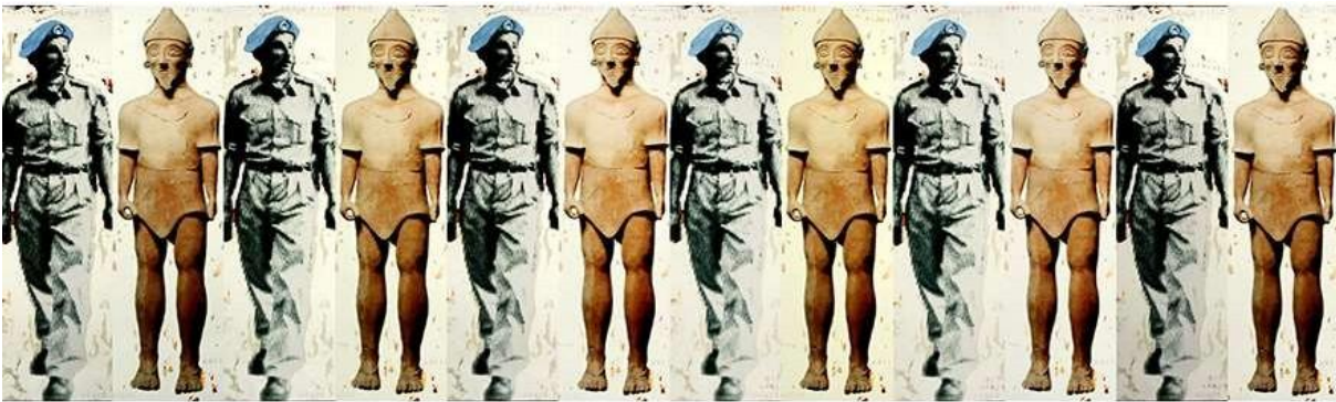
Picture 4: Emin Çiznel “Peace Pirze Antique Project”, 120x480 mixed media, 2015.