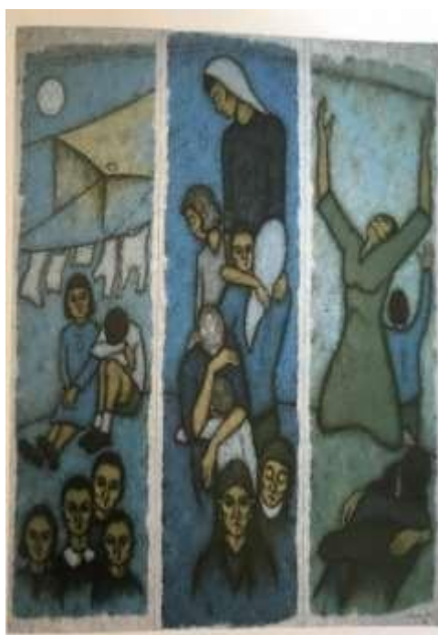
Painting 1: Güner Pir“Migrants” Oil paint on canvas, 200x250 cm, 1988.

The artist Güner Pir, who was forced to emigrate from Baf as a child of an immigrant family, used the theme of migration immensely in his works of art. In general, Cypriot artists have been subject to forced internal and external displacements after the 1950s as a result of increasing conflicts and warfare. It is seen that Pir treated in his works such topics as immigration, abandonment, leaving, and lack of sense of belonging to a certain place.