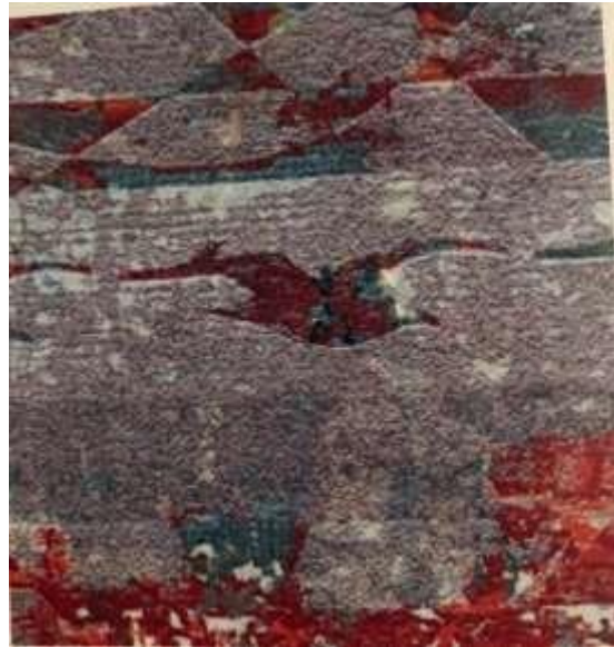
Painting 7: Mustafa Hastürk, Birds and seasons, Acrylic on Canvas, 100x100, 2003.

The fact that the artist did not experience the war and the immigration himself led him to express the events in a more abstract manner. These works which continue as “winter” and “migration”, “summer” and “migration” have a composition understanding which includes the elements of balance and rhythm in a minimalist and plain plastic language. With a mystical impact, this composition triggers the philosophical questioning of “where do we come from and where are we heading to”. As a result, the expression of migration phenomenon in a strong but simple language determines the level of the artist in the field of art. Hastürk’s paintings which describe the journey of humanity and life with an abstract expressionist artistic language take the viewer to an endless venture of art with his strong expression.