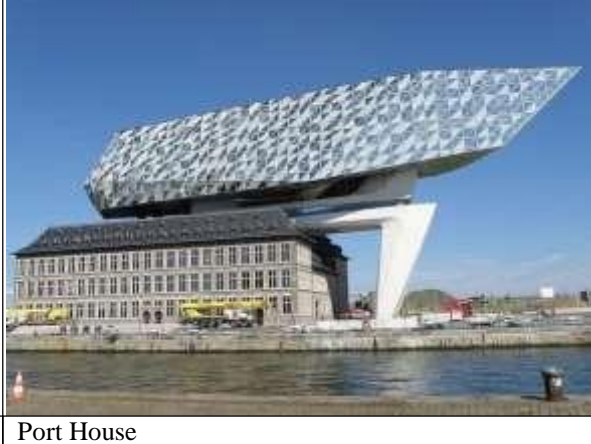
Figure 3. Designs by Zaha Hadid, (URL9,2019; URL10,2019; URL11, 2019)

With its impressive form, the Heydar Aliyev Cultural Center designed by Zaha Hadid has made a worldwide recognition in a short time. It is regarded by travel guide websites as one of the must see spots in Baku and included in