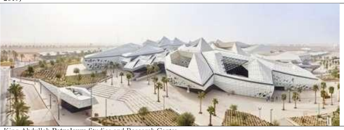
King Abdullah Petroleum Studies and Research Centre