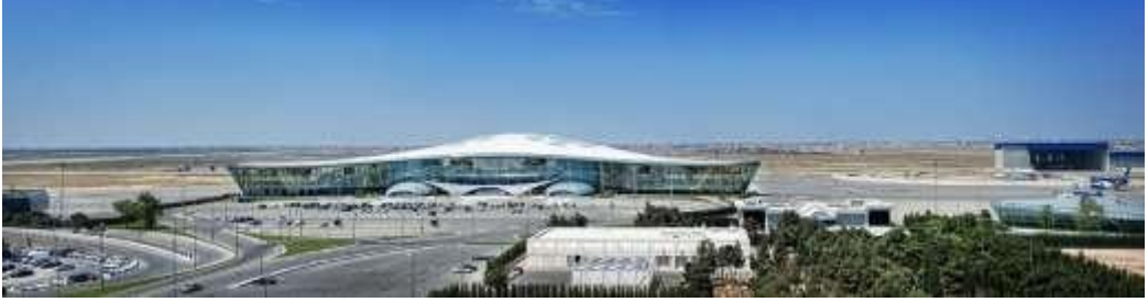
Haydar Aliyev International Airport

Iconic buildings were built to create landmarks, to develop an urban brand and to improve the recognition of the city. Some of the recently constructed icon buildings for the modern urban image are the Flag Tower, the Crystal Hall, the Flame Towers and the Heydar Aliyev International Airport (Fig. 1).