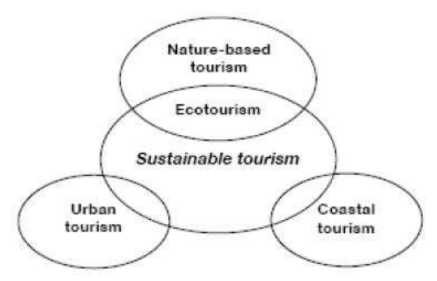
Figure 1. Connection between sustainable tourism and ecotourism (Bien 2007)

One of the most common definitions of ecotourism comes from the International Ecotourism Society and states that ecotourism is "responsible travel to natural areas, which conserves the environment and improves the welfare of local people." Expanding upon this, Martha Honey, a leading expert and author in the ecotourism field, says that authentic ecotourism must include the following seven characteristics (Honey 2008):