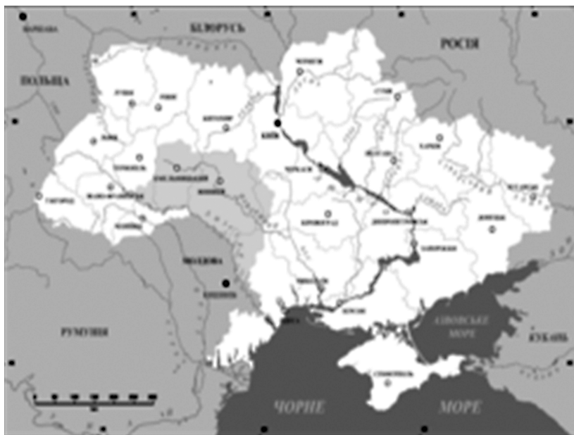
Fig. 1. Podillia region on the map of Ukraine