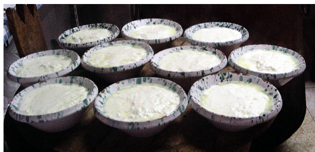
Fig. 2. Examined variants during the extraction of proteins by different ways [12]

It is possible to find more information about methodology of the research conducted in article [12].