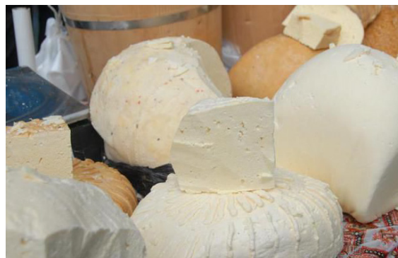
Fig. 1. Albumin cheese "Urda" [12]