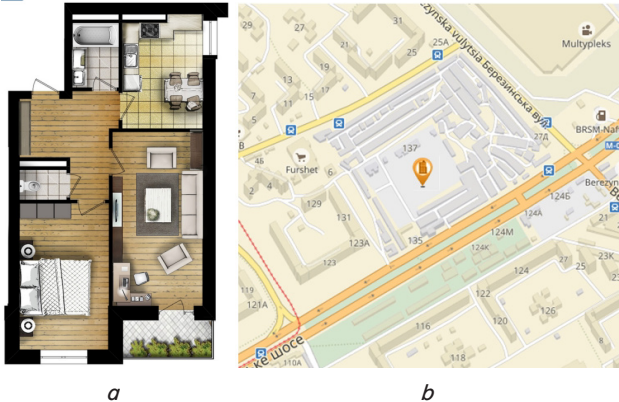
Fig. 1. The location of a two-room apartment in the new building on the Hetmanska St., 7: a – the layout of the apartment; b – the situational plan of the house

As an example for assessing the level of ecological security of housing in the category “Environmental safety of residential premises” in the primary sales market, a two-room apartment in the new building in the city of Dnipro is presented (Fig. 1). The residential building is located in the residential area of the city. Territorially, the location has indicators of a place with a well-developed infrastructure.