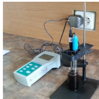
Fig. 4. Examining the alkalinity of finished products at PH-150 MI (Ukraine)

A protein content in the finished products was determined by the Kjeldahl method, which is based on the destruction of organic compounds under the action of boiling sulfuric acid