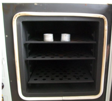
Fig. 3. Drying cabinet for measuring the moisture content of finished goods SNOL (Ukraine)

Among the physical-chemical indicators, we defined a moisture content – drying to the constant mass at 105 °C (Fig. 3); the mass fraction of ash, non-dissolved in a solution with a mass fraction of hydrochloric acid of 10 % – by wet ashing of the sample in nitrogen acid and burning it in an electric furnace; the alkalinity – by a potentiometric method (Fig. 4).