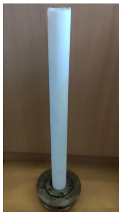
Fig. 4. Testing fabric for water permeability

is 0.00053 m 2 . Then the intensity of the mass flow under the action of water on the hydrophobic coating, which is calculated from (17), is 0.000177 kg/m 2 . The mass flow of water at the border of two plates «a water repellent film – the fireproof fabric» during the action of water, calculated from (16), is 0.009371·10 -5 kg.