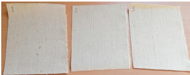
Fig. 1. Model fabric samples for testing

The samples were treated with a modified roofing impregnating solution based on the mixture of organic and inorganic substances «Firewall-Attic» manufactured in Ukraine (a mixture of urea, 28...30 %, and phosphoric acids, 23...24 %) but modified with starch in the amount of 20 % [14].