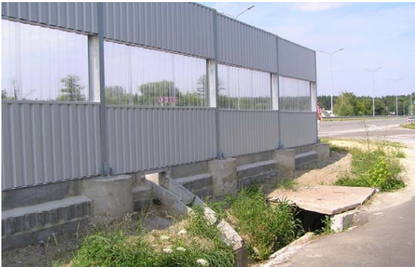
Fig. 4. Drain hole in the noise protection screen

In the presence of a gap between noise-protective screens and the execution of the drain hole in the “classical” way (Fig. 4), it leads to a decrease in the acoustic efficiency of the screen to 3 dBA.