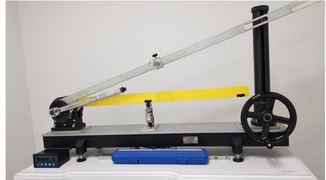
Fig. 1. General view of the installation for calibrating torque keys

Our experiment for the purpose of examining the E_n -statistics was carried out at the installation for calibration of torque keys UMPC-2000 (Ukraine), (Fig. 1). As a calibration object, we used the dynamometric key ANDRMAX 1/2' DR 210 N–M (PRC).