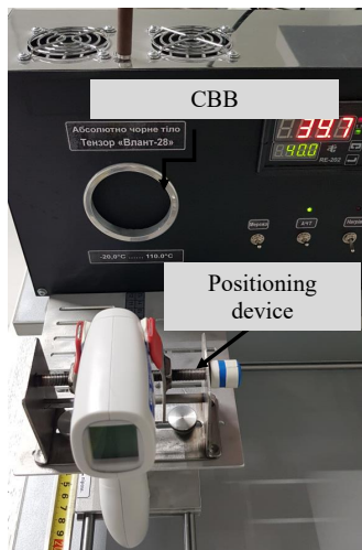
Fig. 4. Installation for calibration of pyrometers, positioning of a pyrometer

a temperature of 40 °C. The maximum uncertainty of the pyrometer according to the passport for this temperature is 1.5 %, which in absolute form is 0.6 °C. The maximum permissible calibration uncertainty should be 0.2 °C. The influential factors on which the calibration uncertainty depends were the positioning of the pyrometer relative to CBB, for which two experiments were conducted. In the first experiment, the positioning of the pyrometer was carried out manually, without the use of a special holder, in the second experiment, the pyrometer was fixed in the holder (Fig. 4). The study was carried out at a temperature of 40 °C. The extended uncertainty of working standard is 0.1 °C, respectively, and the component u_{MP}=0.087 °C.