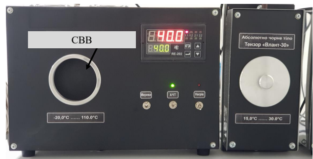
Fig. 3. General view of the installation for calibration of pyrometers

As a calibration object, we used the industrial pyrometer Benetech GM910 (PRC). Calibration was performed at