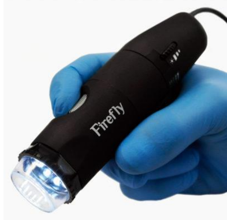
Fig. 2. Dermatoscope (trichoscope) irefly DE330T

The DELTA 20 dermatoscope (fig. 3) has a color rendering coefficient CRI > 87 . The color rendering system is represented by 4 LEDs. Two LEDs can be turned off for side lighting.