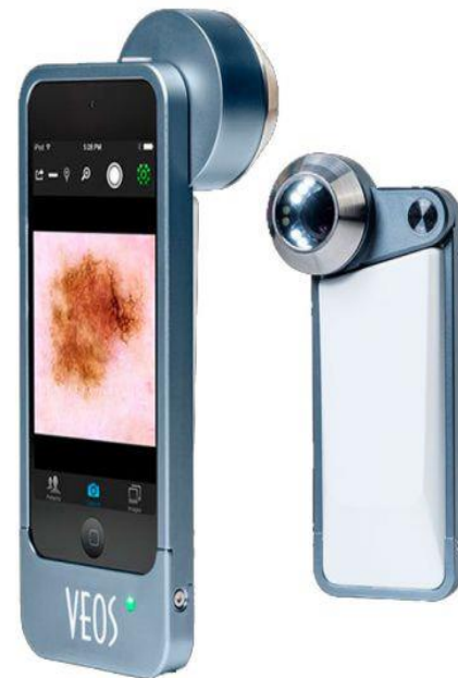
Fig. 1. Digital dermatoscope VEOS DS3

The VEOS DS3 dermatoscope (fig. 1) is a portable digital dermatoscope with a touch screen, an improved lighting system, which allows the study of skin, subcutaneous structures and vascular pattern. Dermatoscopy can be performed by contact and non-contact methods (non-polarizing and polarizing methods). Focus adjustment can be carried out both in manual and automatic modes. The design features of the optical system make it possible to avoid optical aberrations, as well as to carry out high-quality focusing and scaling. The device is equipped with 2 contact boards (immersion and cross-polarized).