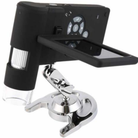
Fig. 5. Digital videodermatoscope UM039

The automated diagnostic system for processing and analyzing dermatoscopic information is presented in fig. 6.