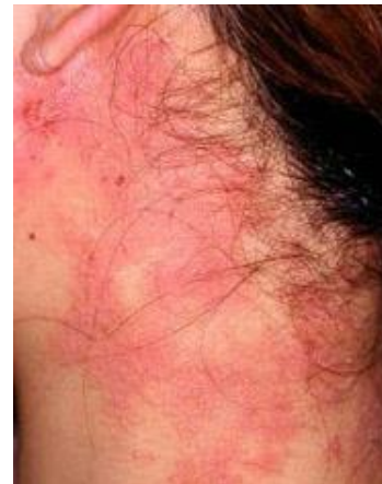
Fig. 7. Localization of AtD lesions

For the studied dermatoscopic images, the average values of the brightness channels in the RGB color model of the table were obtained 1.