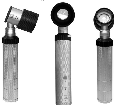
Fig. 4. Dermatoscope Eurolight D30

The Eurolight D30 dermatoscope (fig. 4) has a contact glass with a diameter of 25 mm, a backlight system with an illumination intensity (12,000 Lux) with a service life of up to 50,000 hours, focusing range: from -6 to +3.5 D, tenfold optical zoom, scale for early detection of pigmentation changes in the skin.