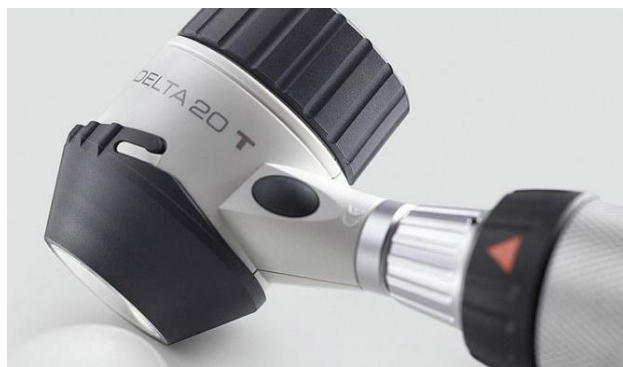
Fig. 3. Dermatoscope DELTA 20

The optics of the device allows a 10-16-fold increase; undistorted all over the plane. The adjustable eyepiece has individual focusing with a correction range from -6 to +6 diopters.