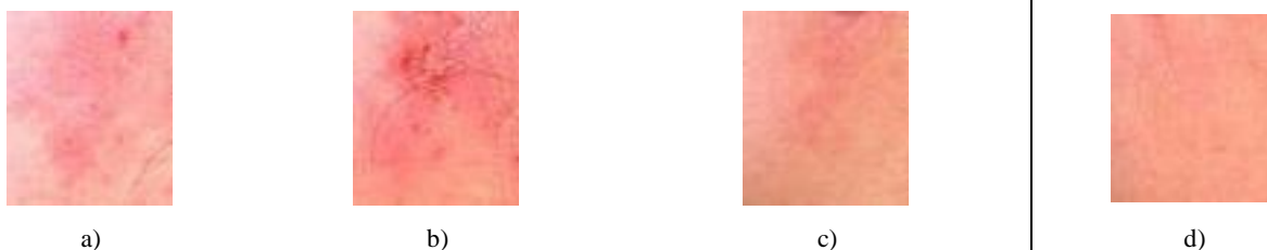
Fig. 8. Localization of ATD manifestations for clinical case No. 1: a) skin condition on the third day of the examination; b) skin condition on the fourteenth day of the examination; c) skin condition on the seventeenth day of the examination; d) skin condition twenty-eighth day of examination