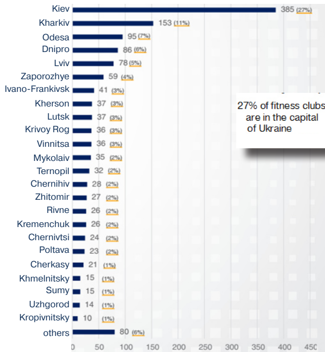
Fig. 2. Number of fitness clubs in the cities of Ukraine [1]

can be considered an average city. Therefore, we have studied in more detail the state of the fitness industry in Lviv.