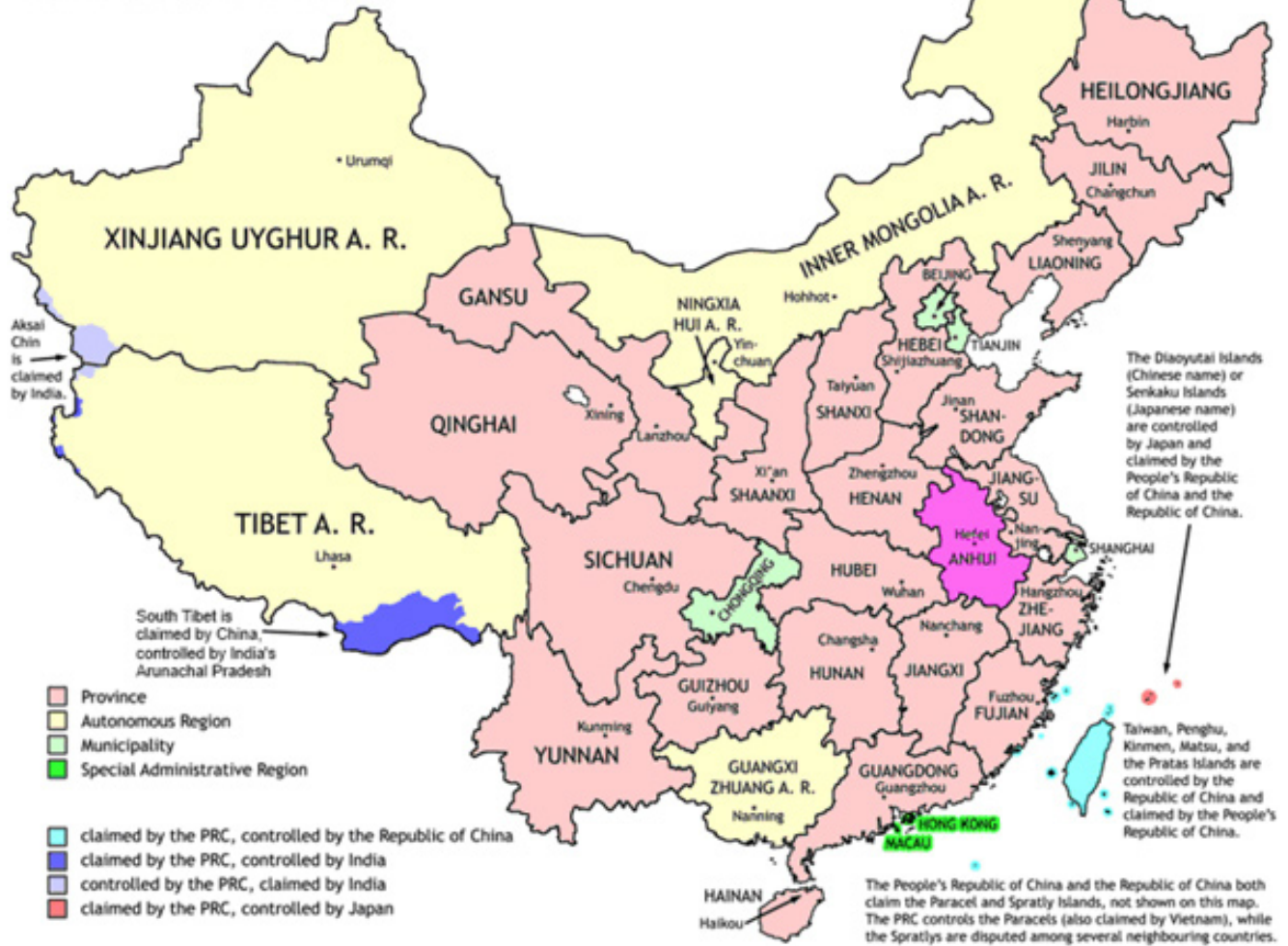
Pic. 1. Administrative division of China