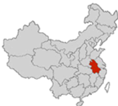
Pic. 2. Geographical location of Anhui Province in China