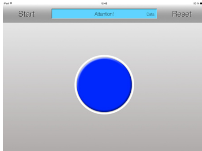
Pic. 1. Interface of a working window of the program for an assessment of a reaction of distinction, reaction to a dynamic object

The interface of all developed programs is simplified and consists of two operating buttons "Start" and "Reset" (pic. 1).