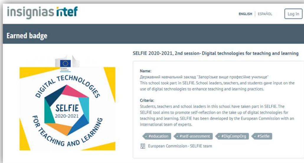
Fig. 1. diploma of the participant of the SELFIE survey of the state educational institution "Zaporizhzhya Higher Vocational School"

information for a structure of individual and group work in the direction of development of digital competence of pedagogical workers.