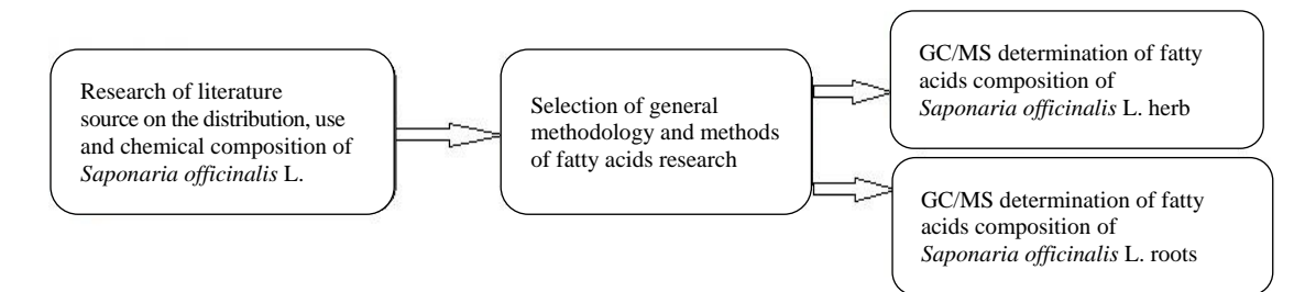
Fig. 1. Design of the experiment

To reach this aim and obtain answers to all questions, the conception of the experiment was done (Fig. 1).