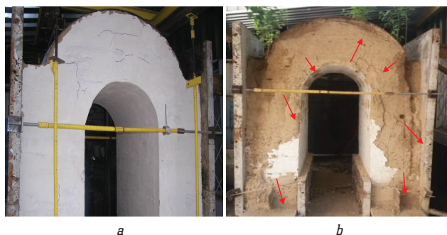
Fig. 1. Soil model of a fragment of the cave passage: a – 2012; b – 2019

The condition of the sample was assessed as unsuitable for normal operation, has a stable tendency to emergency, due to: