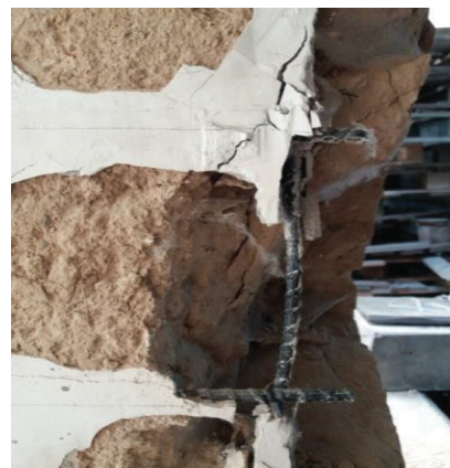
Fig. 2. Ultimate bending of the rod (1.2 cm)

When the value of the limit bending of the rod (1.2 cm) was reached, the loading of the sample was stopped and the soil mass, which was in a stressed state, was strengthened by additional, inclined basalt rods, not connected with the reinforcing cage. Rods with a diameter of 10 mm and a length of 300 mm were installed in the middle of the interior of the model in two rows with a pitch of 240×120 mm. To exclude from the work a pre-installed frame, the vertical rods of the mesh were cut.