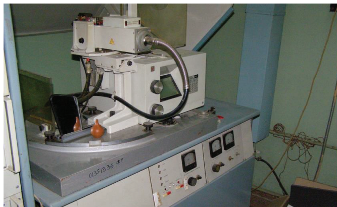
Fig. 1. DRON-UM-1 X-ray diffractometer