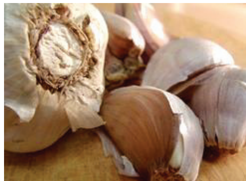
Fig. 5. Bulbs of garlic affected by bacteriosis

Bacteriosis. The disease is spread to garlic and onions, especially during storage of bulbs. The primary infection of the bulbs occurs in the field. Around the stem end of the affected bulb, a large, light or slightly pinkish spot forms (Fig. 5) [28].