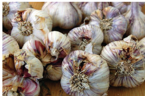
Fig. 4. Garlic bulbs affected by fusarium

Fusarium. On a clove of garlic, the disease manifests itself in the form of necrotic spots, first in the form of dots or ulcers of a small size, then during storage the mycelium grows, the spots increase and rot spreads throughout the entire clove. In the basal part of the false stem, there are superficial light yellow or brown spots, on which, in wet weather, white-pink or reddish plaque appears at the base of puff sheaths – conidial sporulation of pathogens (Fig. 4).