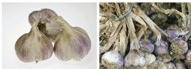
Fig. 1. «Duchess» winter garlic variety

The leaves are light green 47–48 cm long and 2.2–2.5 cm wide. On one plant, as a rule, 8–10 leaves are formed. The bulbs have a rounded flat shape and are covered with 4–5th dry scales of white color with purple stripes along the vessels (Fig. 1). Bulb weight is 50–60 g. The bulb consists of 5–6 aligned, mainly large cloves, covered with thick parchment light brown scales.