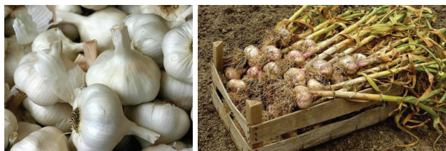
Fig. 2. Merefiansky winter white garlic variety

Merefiansky white garlic variety. Country of Origin: Ukraine. By planting time: winter, ripeness group: early ripe. Arrowed. Mid-season – the growing season is 105–110 days. Bulb of a wide elliptical shape with weak extraction up, dense. The cloves are large, in the bulb there are 5–6 pieces, placed compactly (Fig. 2). Dry scales of white color, thick enough, dense. The leaves are long, wide, semi-upright.