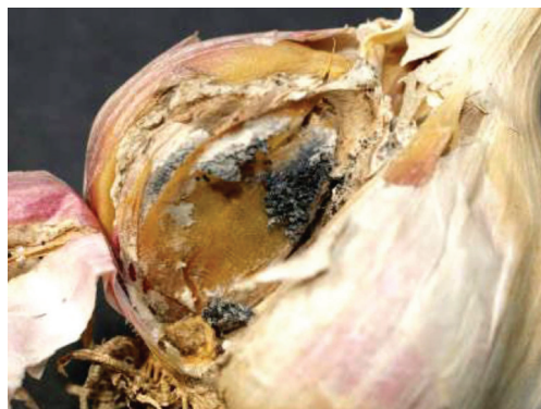
Fig. 6. Garlic bulbs affected by gray rot

incidence of microorganisms to 6.28–6.88 %. The most effective was the treatment of bulbs with Glyoclazine. The number of affected bulbs decreased to 2.67–2.69 %. Biologic treatment most inhibited the development of fusarium. The number of affected bulbs was 0.2–0.65 %.