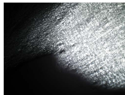
Fig. 3. Photo of a sample of emulsion sauce after spherification in polarizing light (x100)