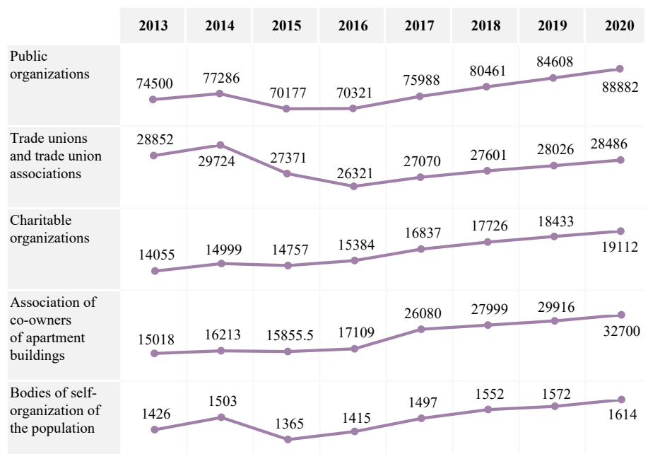
Fig. 1. Growth dynamics of the number of registered public associations by organizational and legal forms in Ukraine by year (modified from [2, 13, 14])

From Fig. 1 it is evident that the number of SCOs has increased in Ukrainian society since 2016, which confirms the need to develop and implement a quality management system.