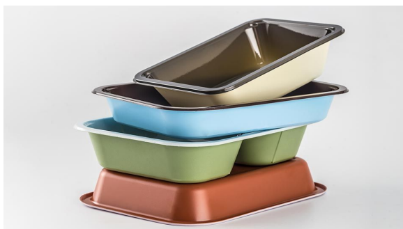
Fig. 1. Types of polymeric C-PET containers

PET packaging is one of the most popular types of packaging for various food products among manufacturers and consumers on the market. C-PET is a material with special components that ensure its heat resistance. This is a one-time durable package that competes with metal aluminum containers. Types of C-PET containers are presented in Fig. 1.