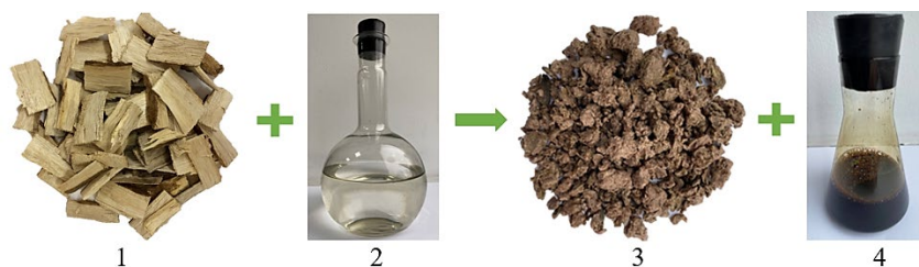
Fig. 1. The general scheme for obtaining fibrous semi-finished products and black liquor: 1 – wood chips; 2 – sodium chloride; 3 – washed fibrous semi-finished product after cooking; 4 – black liquor

The yield of the semi-finished product [15] and the mass fraction of lignin [16] were determined in the solid residue. The content of dry substances [17] and their ash content [18] were determined in black liquor. The total titrated and active alkalinity was determined in the original and used solution according to the standard method [18]. The pH of the solution was also measured using a pH-150MI pH meter and litmus paper. The result was taken as the average arithmetic value of three parallel measurements.