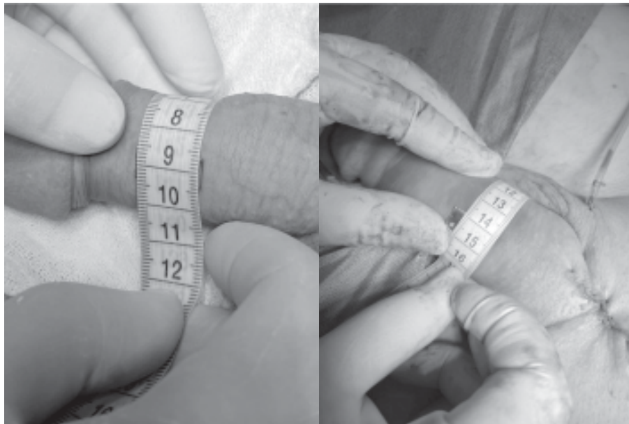
FIGURE 1. Implantation of polymerse PLLA scaffolf with ASC