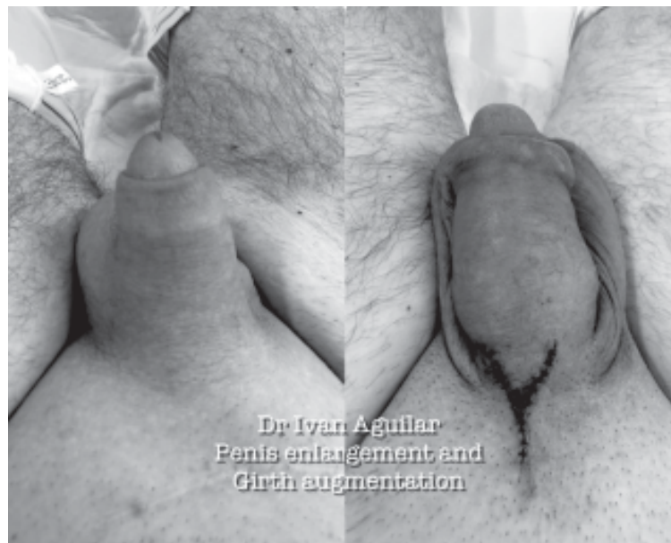
FIGURE 2. Implantation of silicone implant

the application package of licensed statistical programs Statistica for Windows 7.0 and Excel spreadsheet editor Microsoft (USA).