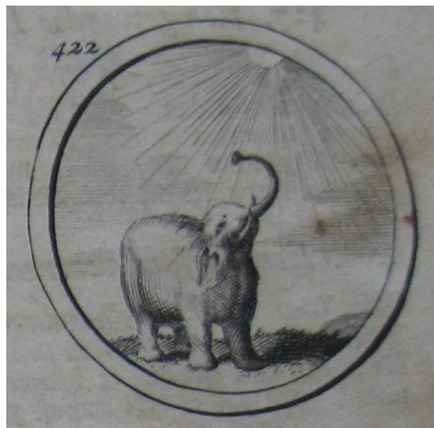
II. 3. Symbola et emblemata selecta , Amsterdam, 1705