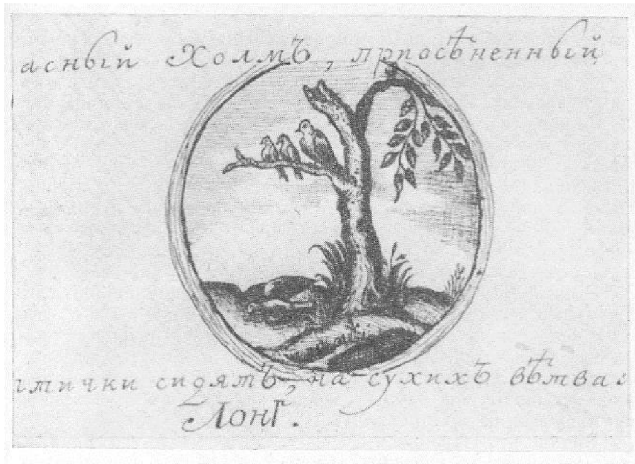
II. 2. drawing G. Skovoroda