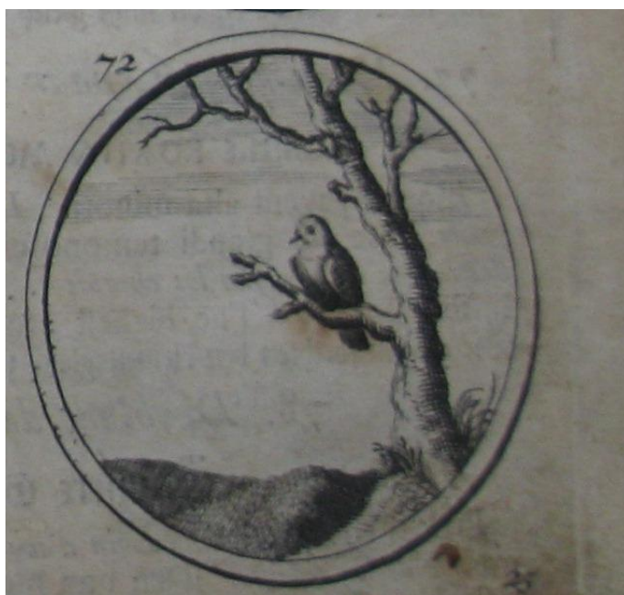
Il. 1. Symbola et emblemata selecta , Amsterdam, 1705

G. Skovoroda presented a whole theory of emblems in his works, moreover, he often accompanied his manuscripts with emblematic drawings and short descriptions or «mottos», which contained the philosopher's most beloved ethical thoughts [10, 95] (Il. 1–4).