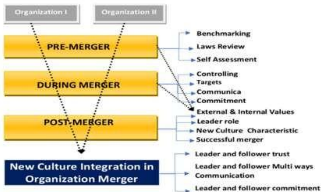
Figure 1. NCIP Model in Successfully Merged Organization (Theoretical Finding)

The results of the preliminary research showed that the successful new culture integration is a determining factor for the success in an organization doing a merger. This case is shown by theoretical NCIP Model resulted based on the synthesis of research results (Aagaard, Hansen & Rasmussen, 2016; Hill, Weiner & Weiner, 2008; Moffat & McLean, (2009) in an organization successfully undertaking merger (Supriyanto & Burhanuddin, 2017). That NCIP Model can be seen in Figure 1.