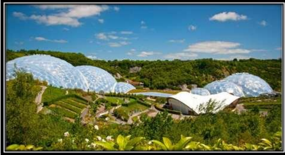
(Figure 2): Adan garden - England - Green and Sustainable Architecture 1

There is a lake with an area of 1231 square meters outside the greenhouse. Before entering the garden, to prevent the entry of plant pests, they enter the quarantine and undergo tough tests.