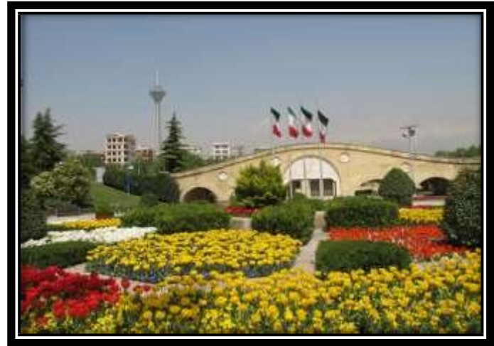
(Figure 3): Bostan Goftegoo in Tehran 1

Boostan Goftegoo was built by the Parks and Green Space Organization of Tehran in the district of municipality of zone 2 in west of Tehran and was opened in May 2003 (Figure. 3).