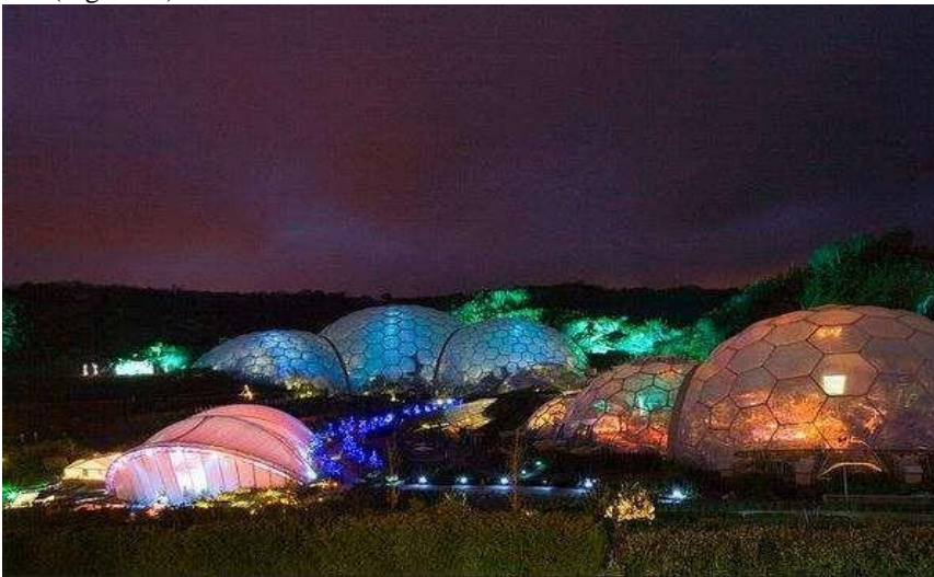
(Figure 1): Adan Garden- England - Green and Sustainable Architecture

The coatings on the greenhouse, which are located inside the hexagonal frames with a diameter of 9 meters, are made of a kind of polymer called ETFE, which has interesting properties. This material can take heat at daytime and give it back at night. These polymers are also transparent and recyclable and last for at least 30 years. It does not absorb any dust and, despite the fact that it has a weight of one glass percent, is very sturdy. This polymer also passes through the ultraviolet UV rays that are needed to grow plants, and sunlight does not change its properties. On these coatings, the nests of the bee and the insect's eye have been simulated. In the tropical greenhouse, an artificial waterfall has also been made (Figure. 1) 1 and (Figure. 2).