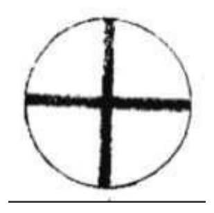
www.noormags.ir Picture 8. The circular wheel in Mesopotamia, which is completely circular.

In general, in India, the circle is the symbol of time and the symbol of continuous and circular motion of the sky that is related to divinity. (Alfred Hohneger, 1997, p. 31)